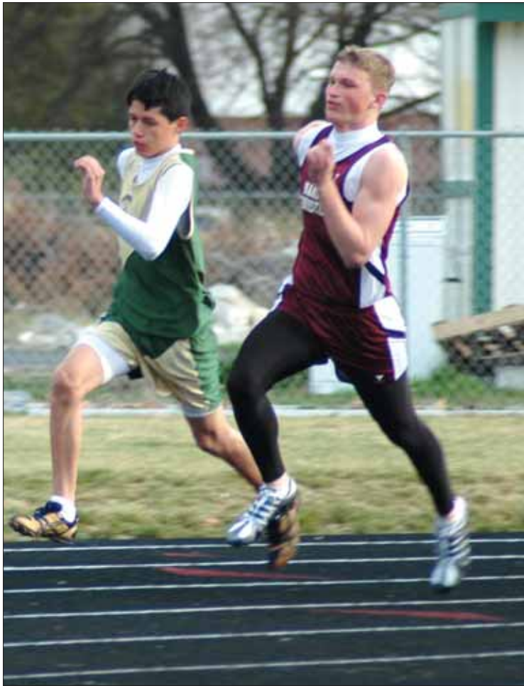
Into the turn