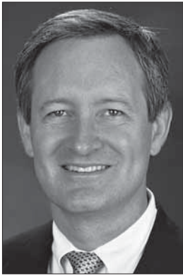
Sen. Mike Crapo

For the first time since the Great Depression, the average savings rate of Americans has dropped into negative numbers. Nearly 60 percent of parents don't restrict how their children spend the money they are given. Add this to the following statistics about financial literacy in our country, and you can see there is cause for concern: • 65 percent: Percentage of 4,000 high school students in 33 states who received an F on tests evaluating knowledge of personal finance basics in 2004; • $11 trillion: Household debt in the United States in the third quarter of 2005; • 2.04 million: Individual bankruptcies filed in 2005; • $3,000: Average credit card balance of college seniors, the majority of whom own four or more cards; • 42 percent: In 2005, percentage of workers or spouses who calculated the amount needed to save for retirement (down from 53 percent in 2000). These numbers represent a rather unstable financial foundation for many families and individuals. With ever-increasing threats of telephone and Internet fraud and outright electronic credit card theft, it's more than a little frightening. In Idaho, there is no lack of financial literacy education, but there is a lack of general knowledge about how to obtain these services. Idaho has strong financial and education institutions that have taken up the challenge of educating people of all ages about financial literacy. The United States Senate has declared April "Financial Literacy Month," providing